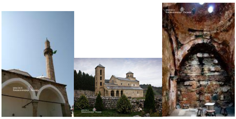
The Altun Alem

Novi Pazar is also rich in cultural and historical monuments from the Ottoman period, when the city was one of the most important and largest trade centers in the Balkans: the Altun Alem mosque, which was built between 1516 and 1518, the Lejlek Mosque, Arab Mosque, Turkish bath, Novi Pazar Fortress etc.